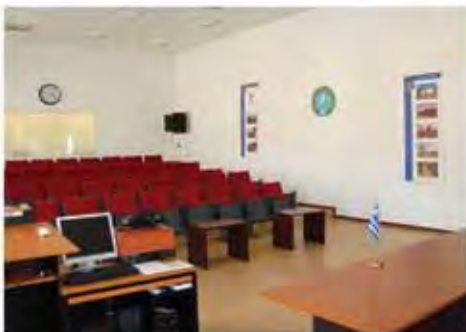
Main Conference Hall