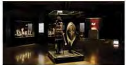
Visit to War Museum of Thessaloniki and to Museum of Fort Rupel in Serres.