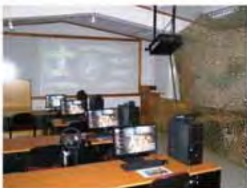
VBS NATO Labroom