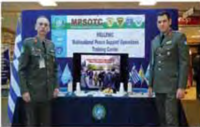
Hellenic MPSOTC participation in the Market Place in Brussels from 19 - 20 March 2014.

Visit to Vergina museum where the Greek archaeologist Manolis Andronikos unearthed the burial site of the kings of Macedon, including the tomb of Philip II, father of Alexander the Great.